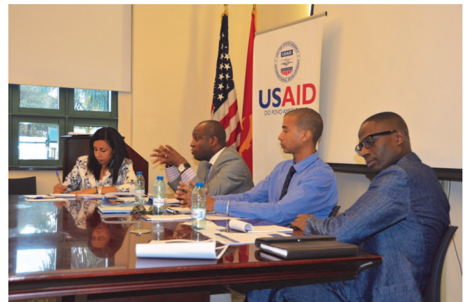
Moderator and panelists for the YALI event at the 'roundtable'

On May 16, USAID/Angola, organized the first listening session meeting with Angolan youth leaders through its Presidential Initiative for Young African Leaders which aimed to share ideas, promote and give voice to young leaders Angolans and understand how the U.S government can support and determine what can be done at regional level on empowerment of youth. The first listening session topics included "Community Participation in each Education and Culture, and Local Elections."