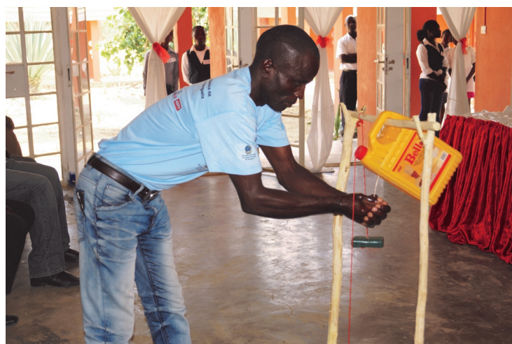
An ADPP staff member demonstrates the "tip-tap" method of hand washing.

The program will support teacher training in WASH and also construct over 100 latrines in area schools. The project will mobilize a total of 5,000 families around 150 schools in latrine construction and the permanent systems for washing hands and train 800 teachers in sanitation and hygiene.