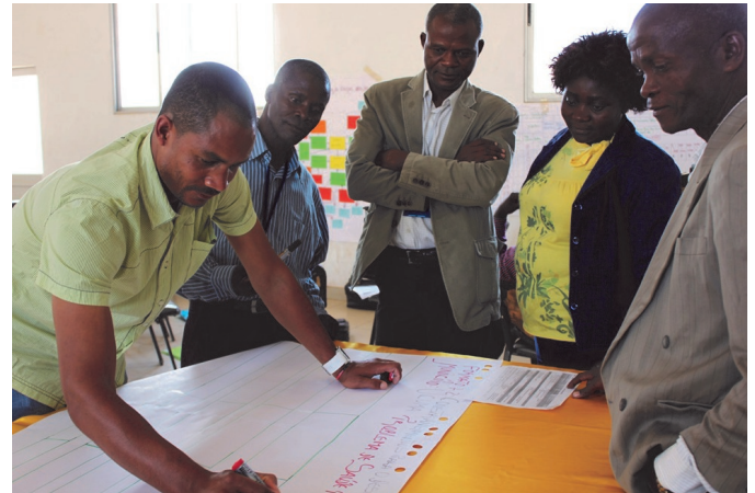
Community Health Leaders join together to plan for community health needs

This process brought together 20 members of the municipal health teams, including the Municipal Health Directors, to analyze the health information data that had been organized by each health municipality department team with SASH's support in a previous phase.